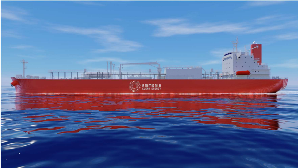
Ammonia-fueled Ocean-going Vessel (Image)